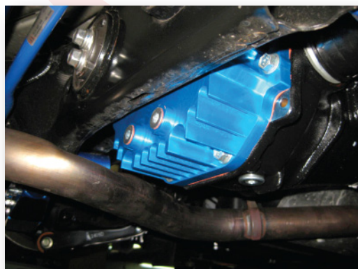
Replaces Factory Cover