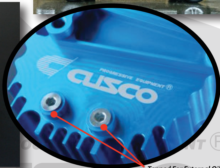
Tapped For External Oil Cooler