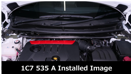
1C7 535 A Installed Image