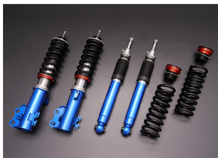
Vehicle Height Adjustment