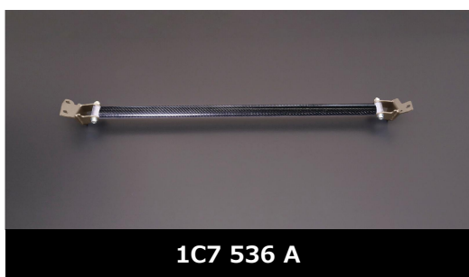
1C7 536 A