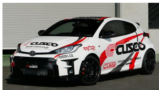
«Applicable Vehicle» GR Yaris GXPA16