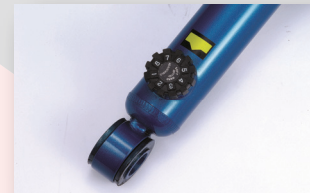
8Way rear damper adjust available on some models

FULL HEIGHT ADJUST (via fully threaded shock)