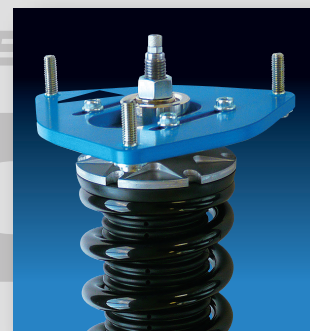
Pillowball Upper Mount Equipped Versions Available

RIBBED KNUCKLE BRACKET Specific metals chosen for each unique vehicle requirements Long lasting design emphasized for this high stress load area