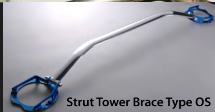
Strut Tower Brace Type OS