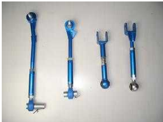
from Left Pillow tension rod, Front Pillow lower arm, Rear Upper arm, Rear Toe control rod