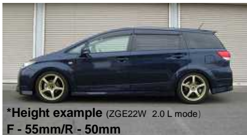
*Height example (ZGE22W 2.0 L mode) F - 55mm/R - 50mm