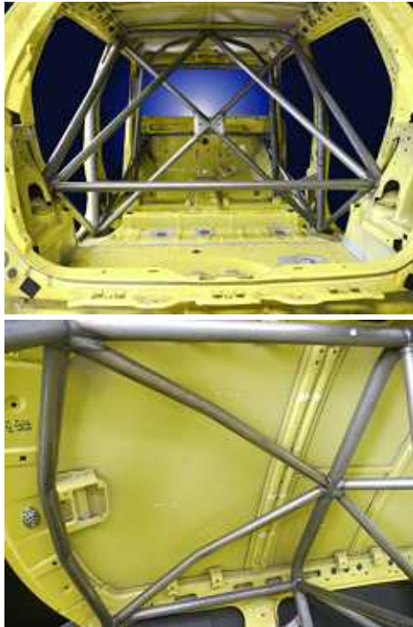
SUZUKI SWIFT Sport (ZC31S) (FIA homologation No. A/N-5703)

It's designed based on feed back from actual Motorsport competition to pursue safety and speed with concerning safety, strength and rigidity balance. Additionally concerning to use on Rally competition, it's designed with consideration working efficiency such as swapping spare tyres.